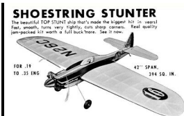
THE GOLDBERG SHOESTRING PROFILE STUNTER - EARLY NOVEMBER

PLEASE NOTE – PRICES DO NOT INCLUDE POSTAGE