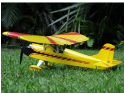
THE AEROFLYTE NOVA – EARLY NOVEMBER