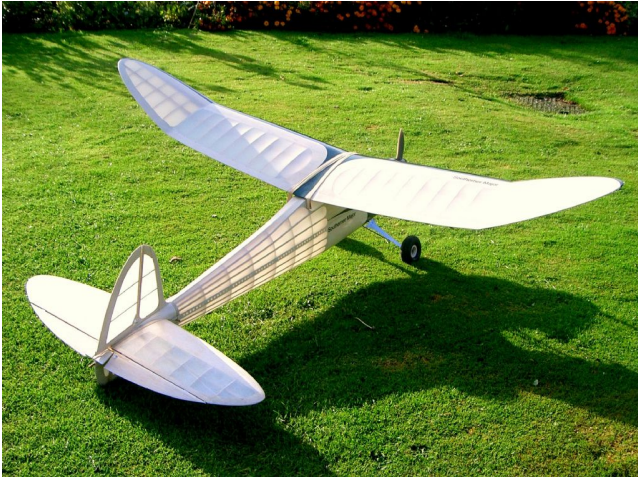
THE SOUTHERNER "ELECTRIC" – LATE NOVEMBER