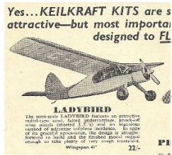
THE KEIL KRAFT LADYBIRD – LATE NOVEMBER